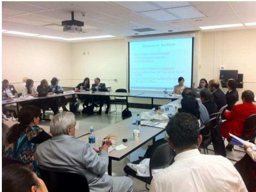
Jobs & Small Business Development plenary at The Ohio State University Wexner Medical Center

Recommendations made by participants in this session include: