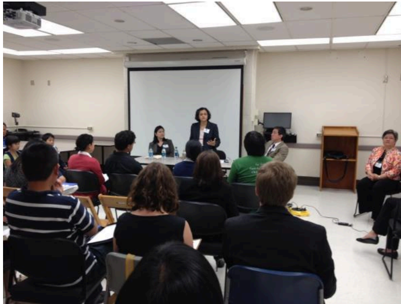
Education plenary session at The Ohio State University Wexner Medical Center.