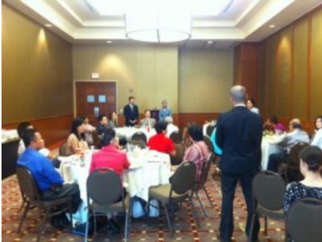
Breakfast meeting with Midwest AAPI community leaders and White House officials at The Ohio State University Wexner Medical Center.