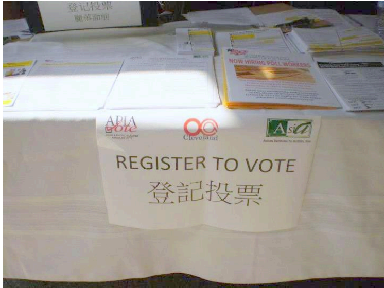
Sept. 16, 2012. Asia Plaza , Cleveland, OH.