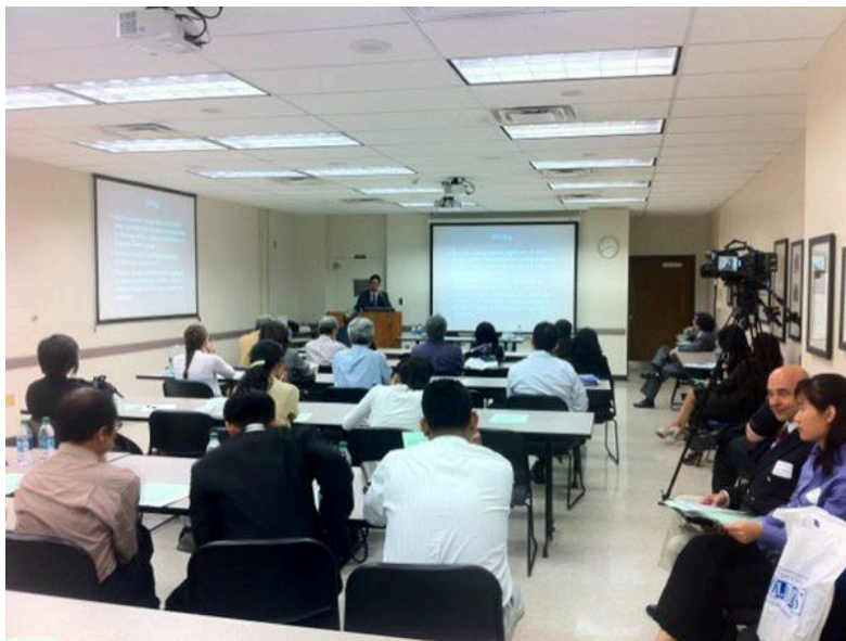
Civil Civil Rights & Immigration Reform plenary session at The Ohio State University Wexner Medical Center.

Later in the afternoon, Summit participants broke out into plenary sessions on Civil Rights and Immigration Reform, Jobs and Small Business Development, Health Care and Health Equity, Education, and Housing and Home Ownership. Each plenary session featured national AAPI experts, including officials from the Department of Health and Human Services, Department of Housing and Urban Development, Department of Education, and Department of Justice.