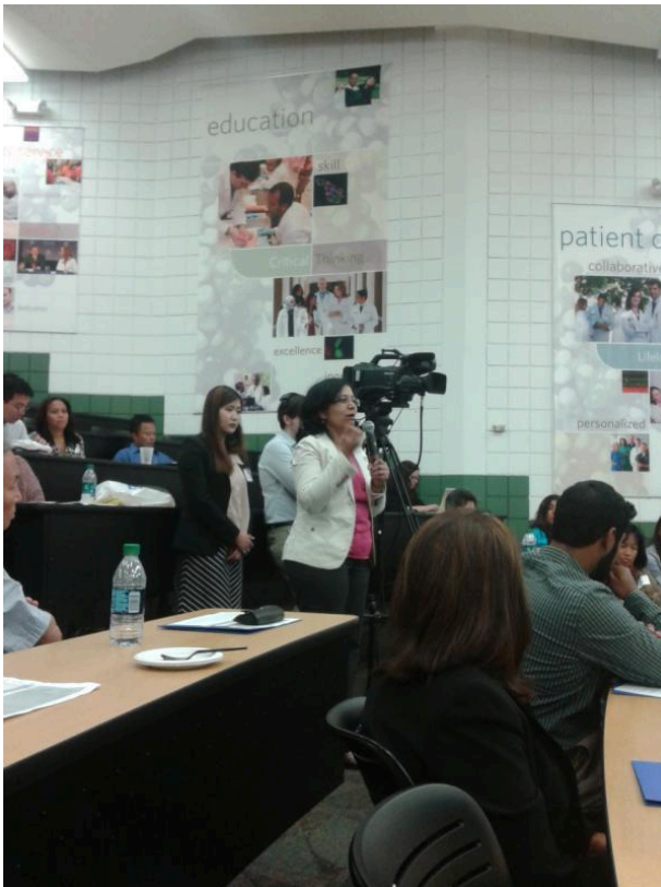
Participants voice their concerns during the Town Hall Session.

During the subsequent Summit Town Hall Session , participants offered suggestions, made comments, and posed questions related to plenary session discussions. One high school student spoke about how she and her classmates had created a diversity awareness class elective at their school and made diversity training mandatory for their teachers. Another powerful story came from a representative of the Mon community in Akron, OH, who described how a factory worker's death may have been related to repeated denials of requests for a work break.