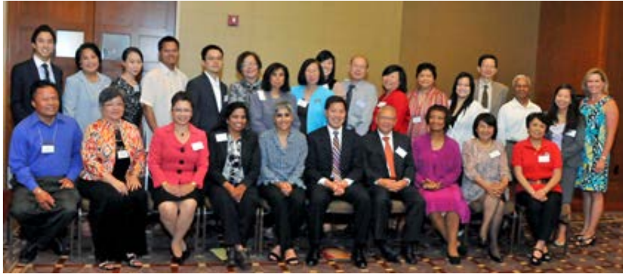
AAPI leaders share concerns, discuss strategies for outreach to members of their communities, and leave with renewed vitality and commitment.