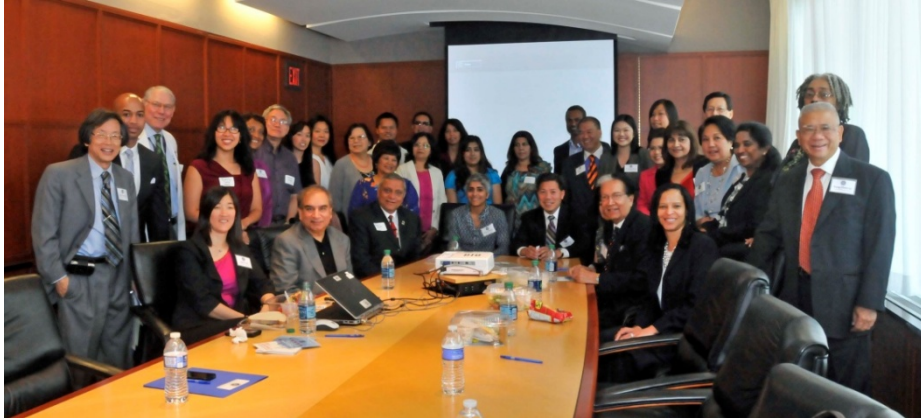
AAPI leaders from across six Midwestern states meet Chris Lu, Kiran Ahuja, and representatives from Federal and state agencies.