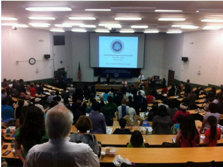
Main auditorium at the WHIAAPI Midwest Regional Action Summit at The Ohio State University Wexner Medical Center.