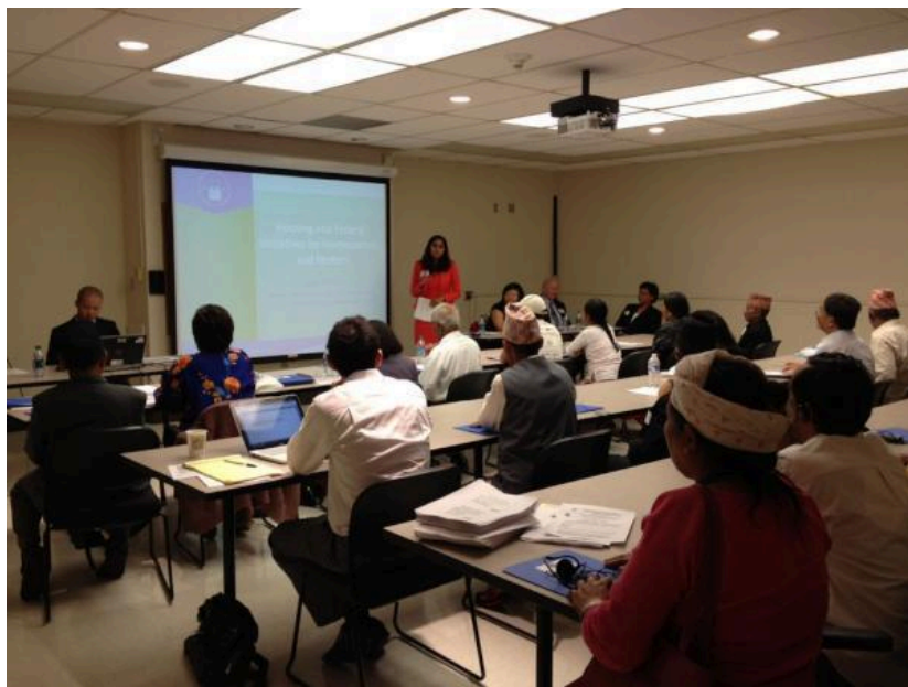
Housing plenary at The Ohio State University Wexner Medical Center.